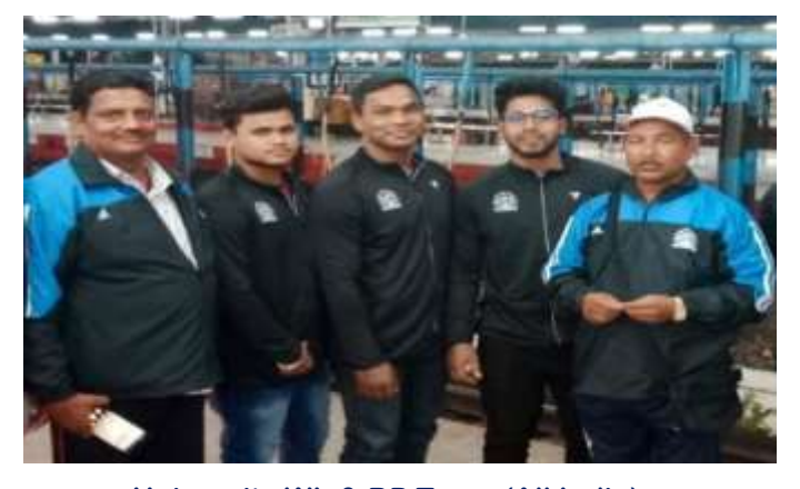
University WL & BP Team (All India)