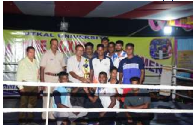
INTER COLLEGE BOXING CHAMPIONSHIP