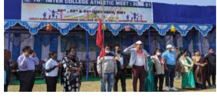
Opening ceremony of 70th Inter College Athletic Team 2021-22