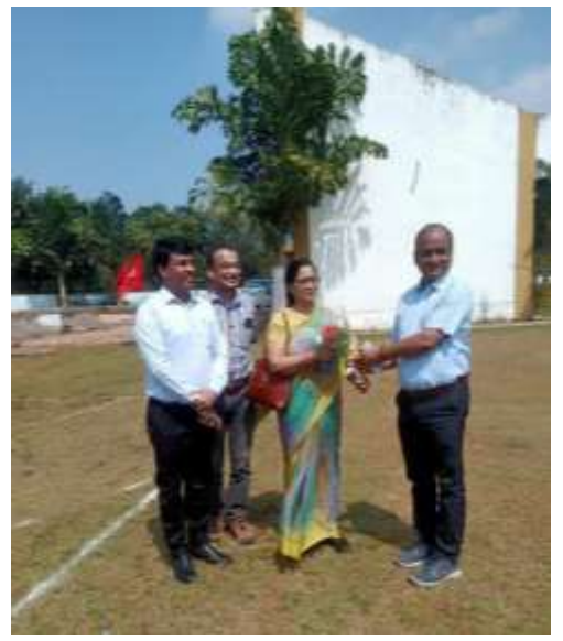
Inauguration of Hand Ball Court at Biju Patnaik Sports Complex