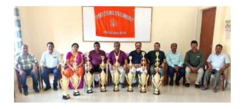
The Officials of Utkal University with State Championship Prizes