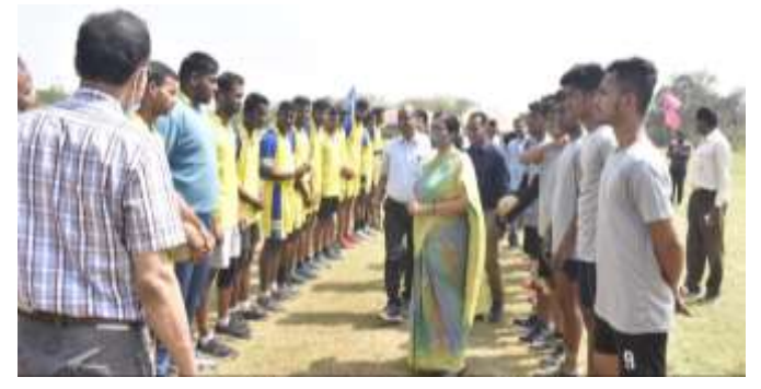
Inauguration of annual sports activities (2021-22