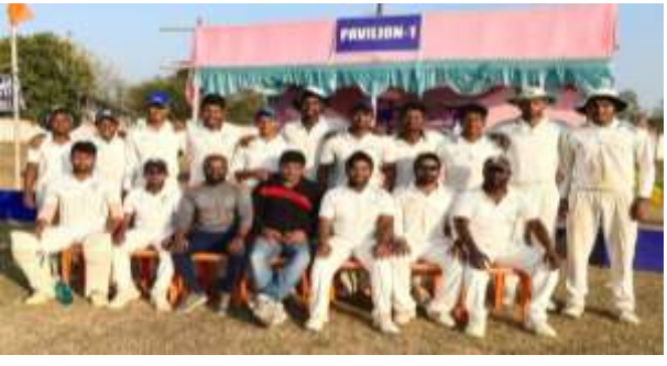
University Cricket Team (State Inter University Championship)