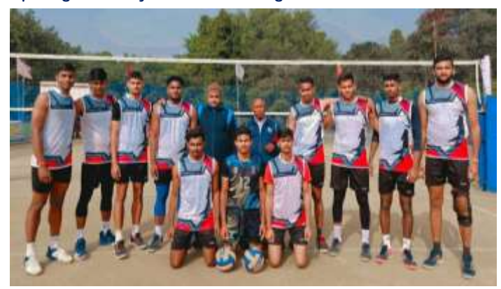
East Zone 3rd position, University Volley Ball Team