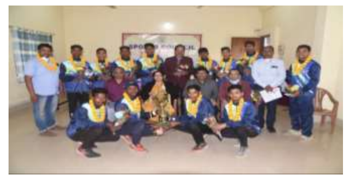
EAST ZONE INTER UNIVERSITY KHO-KHO(MEN) CHAMPION – 2021-22