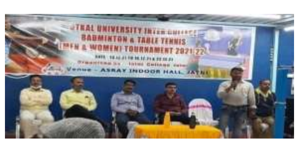
Inter College Badminton Tournament