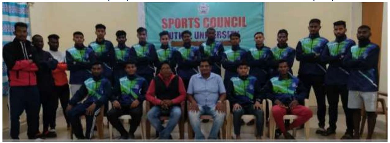
UNIVERSITY FOOT BALL (MEN) TEAM