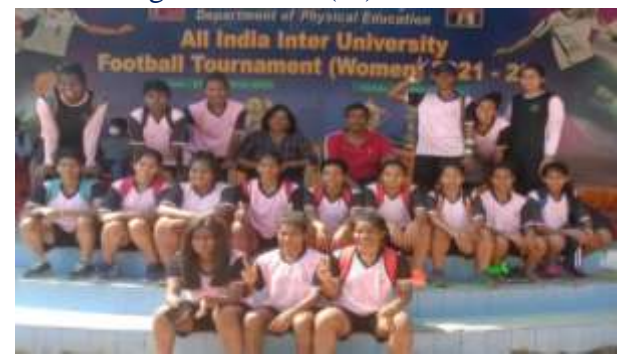
University Women Football Team (All India)