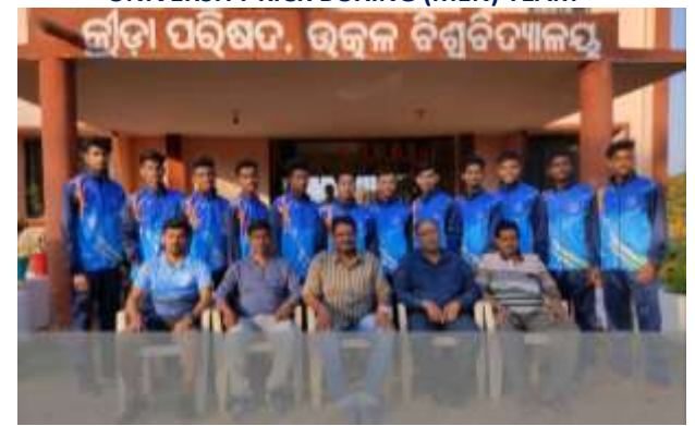
UNIVERSITY KHO - KHO (MEN) TEAM