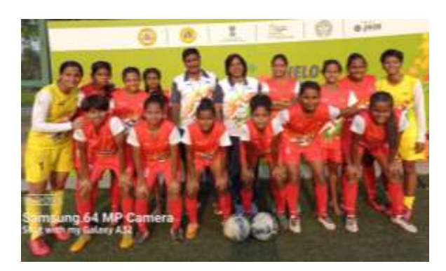
University Women Football Team (Khelo India)