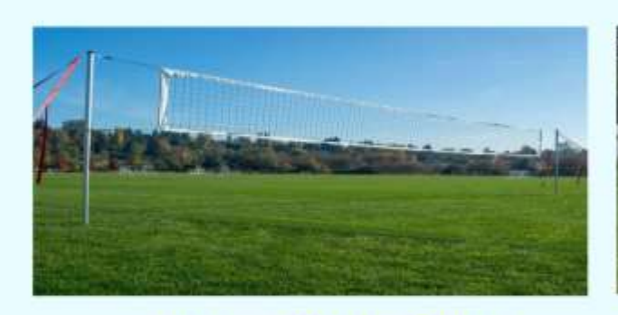
VOLLEY BALL COURT