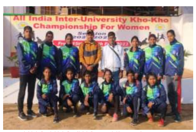
KHO-KHO (WOMEN) TEAM