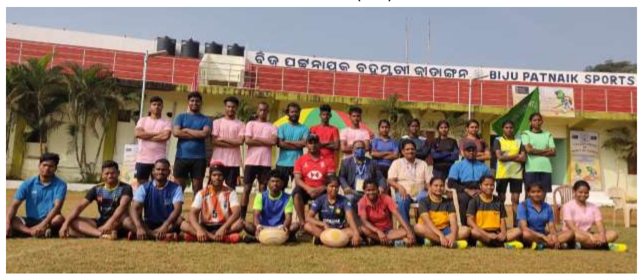
UNIVERSITY RUGBY TEAM (MEN/WOMEN) COACHING CAMP