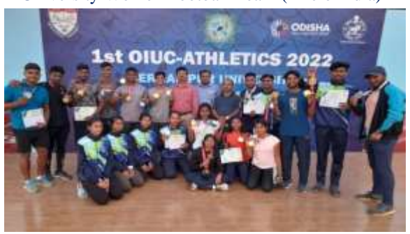
University Athletic Team (State Inter University Championship)