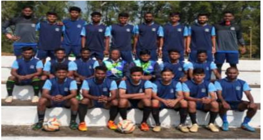
FOOT BALL (MEN) TEAM