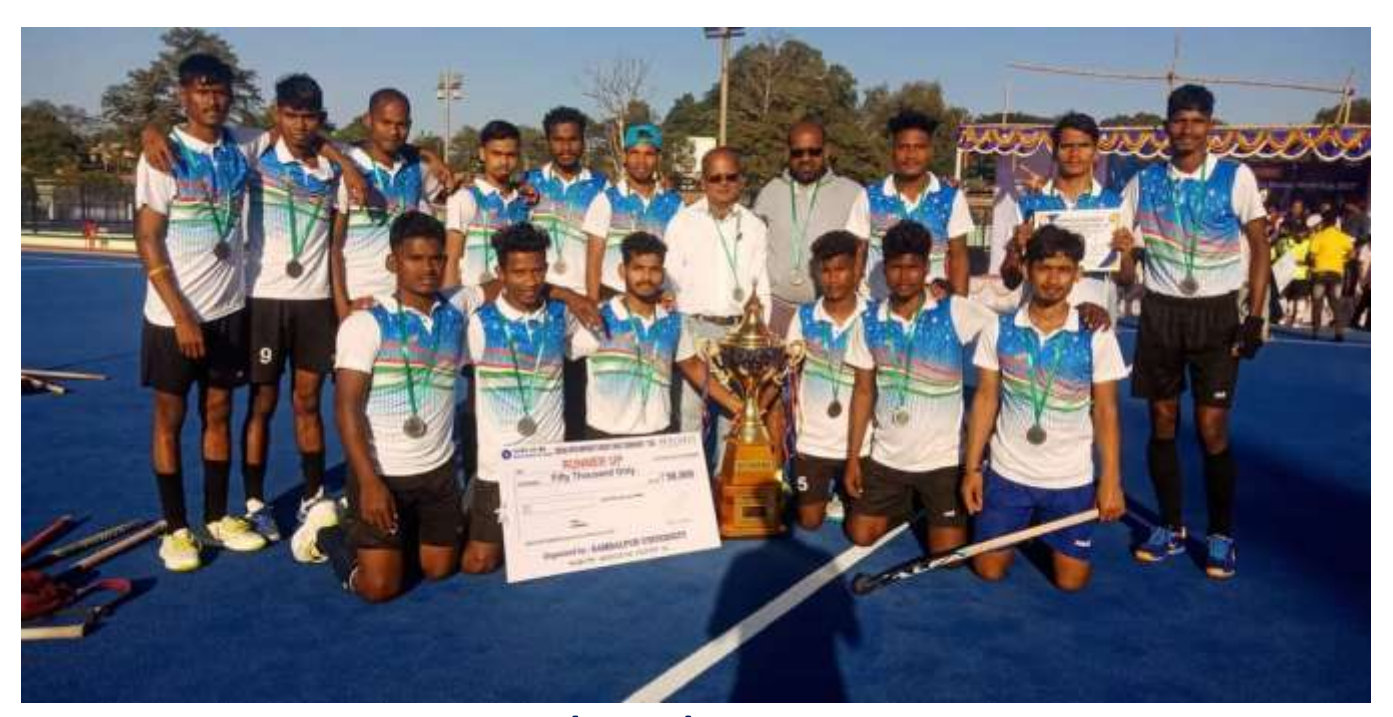
HOCKEY (MEN) RUNNERS -UP