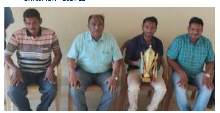
Indivisual Chess Champion (State University)2021-22