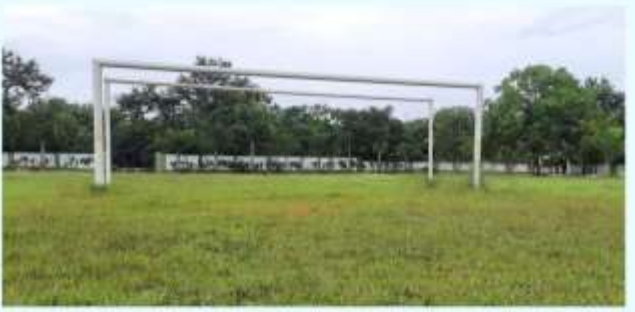
FOOT BALL COURT