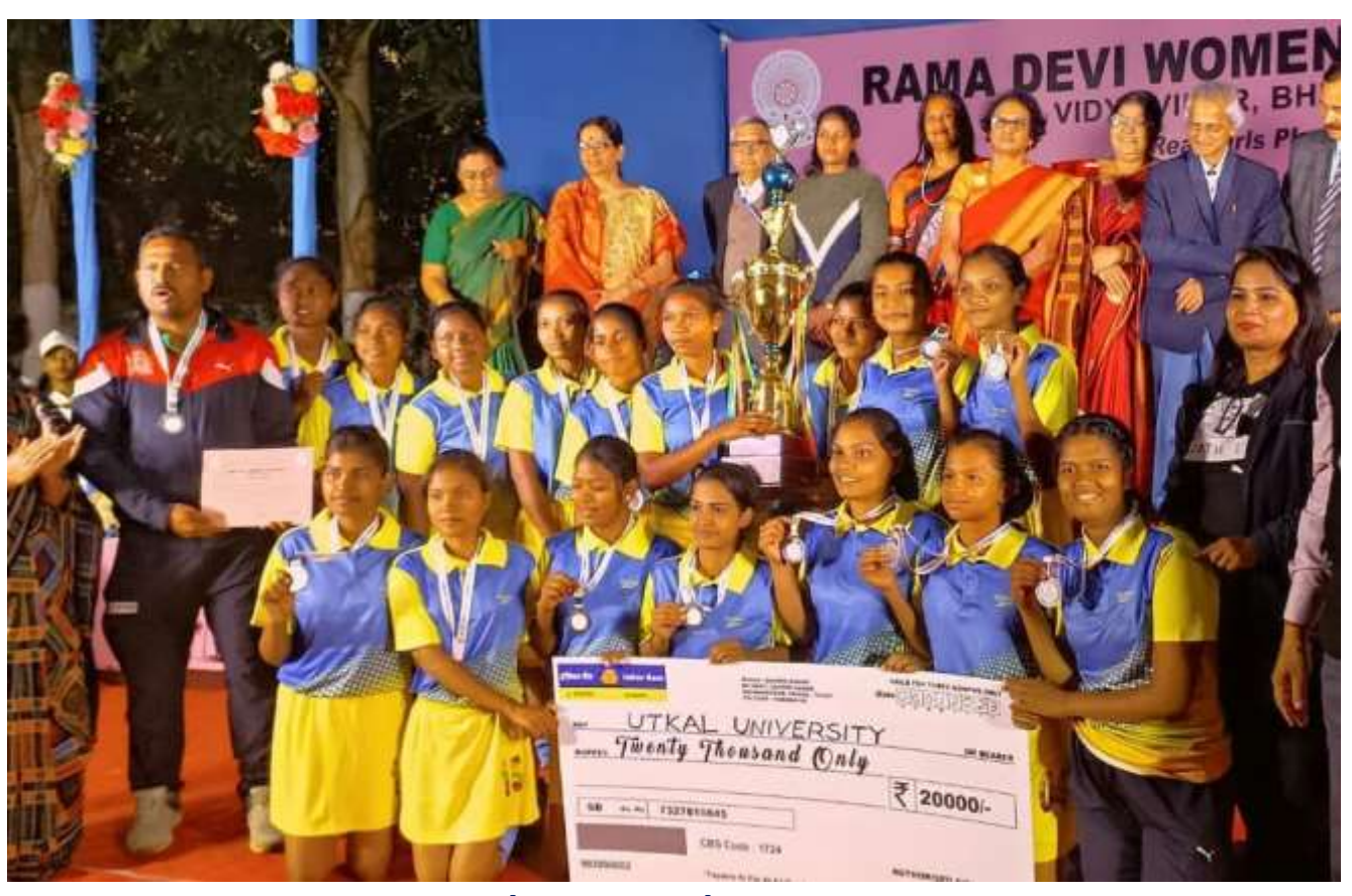
HOCKEY (WOMEN) RUNNERS -UP