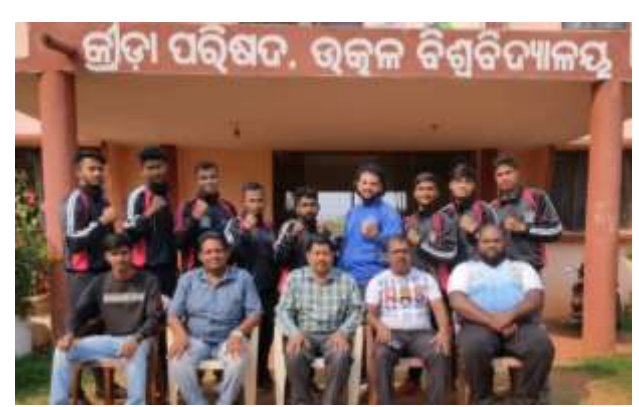
UNIVERSITY KICK BOXING (MEN) TEAM