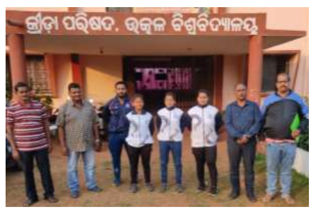
UNIVERSITY WEIGHT LIFTING (WOMEN) TEAM