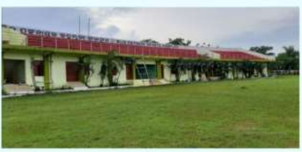
BIJU PATNAIK STADIUM