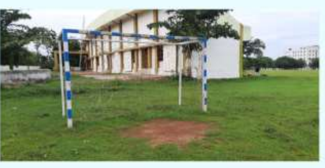
HAND BALL COURT