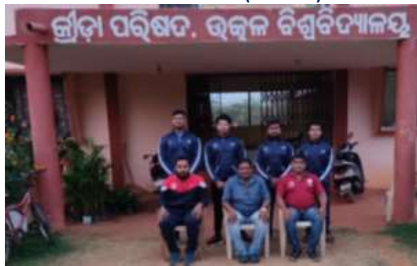
UNIVERSITY WEIGHT LIFTING (MEN) TEAM