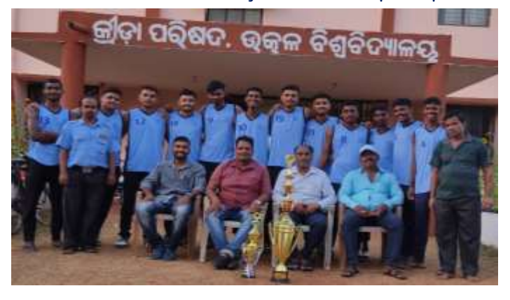
East Zone Champion University Basket Ball Team