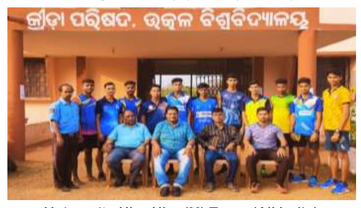
University Kho-Kho (M) Team (All India)