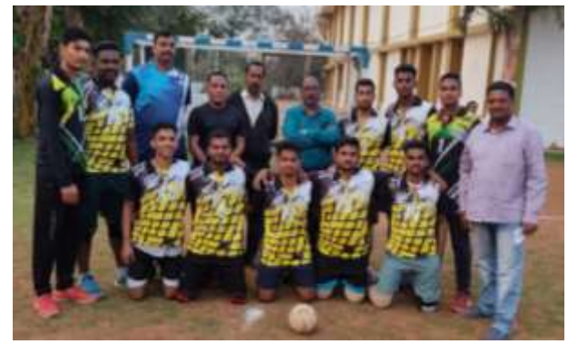
UNIVERSITY HAND BALL TEAM COACHING CAMP