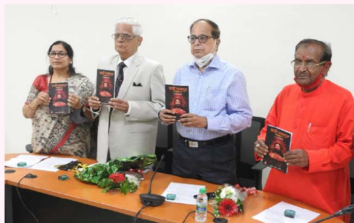
Hindi book on Jayee Rajguru released