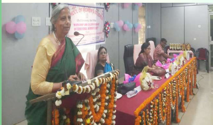
Celebration of International Women's Day in Utkal University

Women have performed at par alike men in every field of capability, self-sufficiency and so on. In spite of which they are not provided with proper status as men in the great march of civilization. They are capable enough to participate in the development of society. Everyone should take equal responsibility in a family. Besides competing with men, they should get involved in decision making process was the major thrust of deliberation during the celebration of Women's Day at Utkal University. On the occasion of International