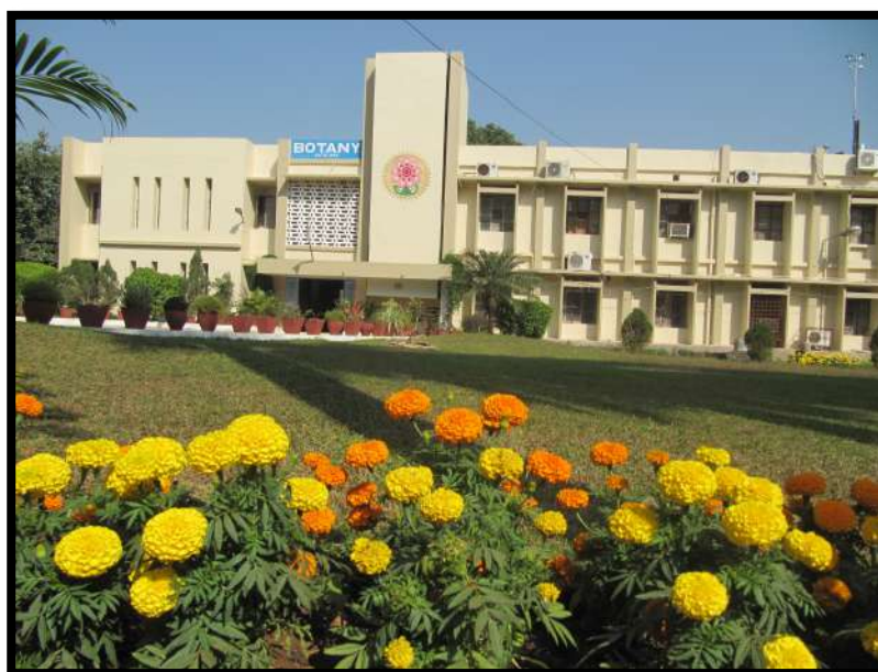
View of the Department

Since 2000, apart from its regular courses, the Department offers two Post Graduate Self Financing courses in Applied Microbiology and Environmental Science. The Department has received funds from UGC under DRS Programme in three phases and from DST under FIST Programme in two phases. In addition the faculty members received