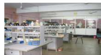
MSc. Laboratory -I