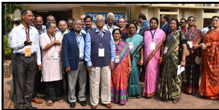
Utkal University Zoology Alumni Association annual meet

organized the 15 th Utkal University Zoology Alumni Association (UUZAA) annual meet on 4 th February 2018