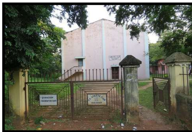
P.G. Athletic Club

The Sports Council has in its credit many talents who have successfully established themselves in the field of games and sports at national and international level.