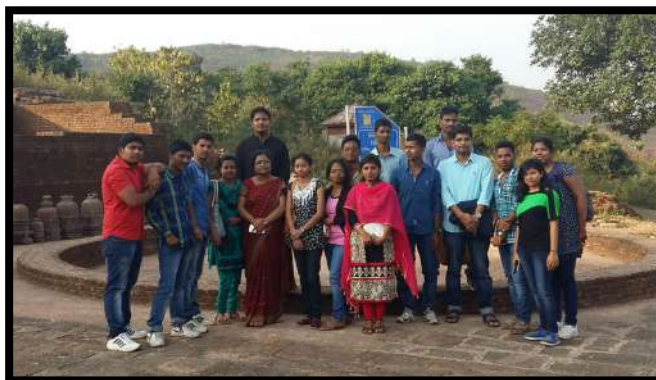
Study tour to Ratnagiri and Lalitgiri