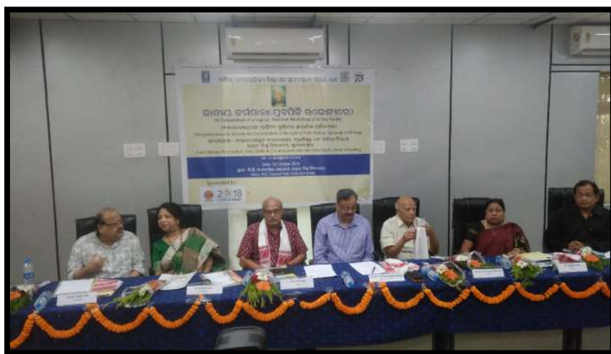
National Workshop for the Youth organised in collaboration with Fakirmohan Foundation, New Delhi

Established in the year 1969, the Department of Odia Language and Literature is one of the premier institutes on Language and Literature, in the state. The department has been fulfilling the higher education aspirations of Odia language students from the State for almost half a century. At present, the Department of Odia continues to revel in a good reputation and brand for its qualitative teaching learning experiencing in Post Graduate, M.Phil and Ph.D programmes for Odia Language & literature. The Department extends its intellectual domain by getting involved in many Interdisciplinary study areas including Natural Language Processing (NLP), Linguistics & Anthropological Studies and Comparative