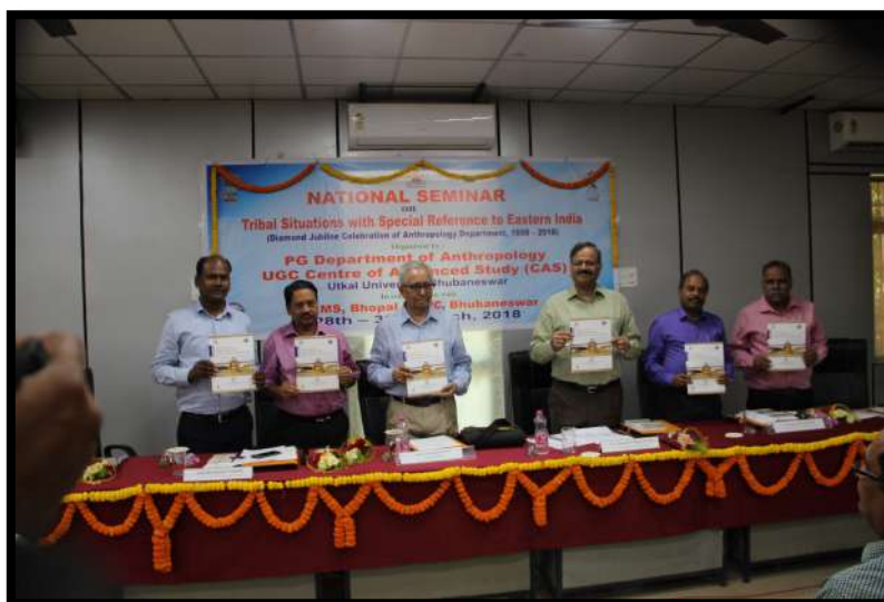
National Seminar on Tribal Situation with Special Reference to Eastern India 28th - 30th March 2018