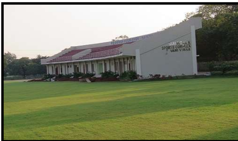
Biju Patnaik Sports Complex

also among affiliated colleges / institutions.