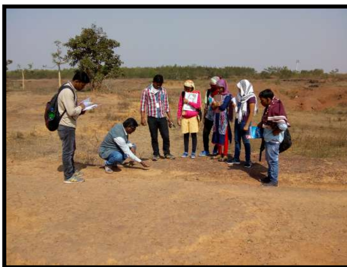
Students during fieldwork

It has collaborated with a number of international and national centres/organizations. These include University of Sussex, State University of New York, University of Utha, Orissa German Project, and Indian Council for Medical Research, Jawaharlal Nehru University, Anthropological Survey of India,