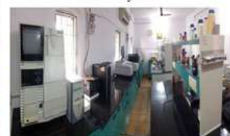
MSc. Laboratory -III