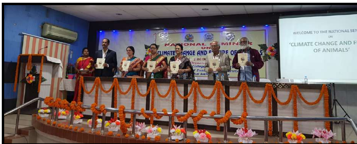
Figure 1 National Seminar on Climate Change & Future of animals