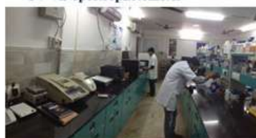
MSc. Laboratory -II