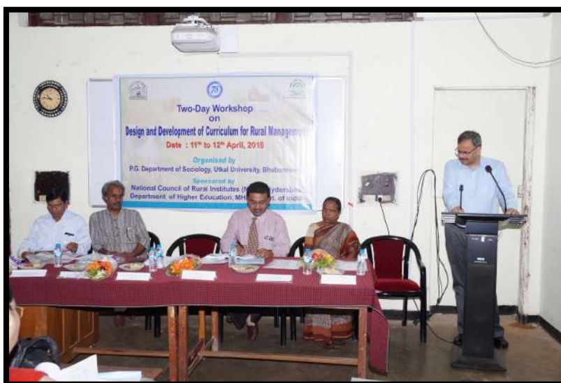
Workshop on Curriculum Design and Development for Rural Management

Mahatma Gandhi Prabandh Grameen Vidya Abhiyaan (Ministry of Human Resource Development, MHRD, Govt. of India).