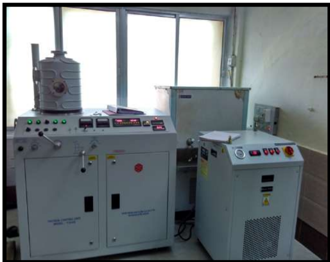
Vaccum Coating Unit