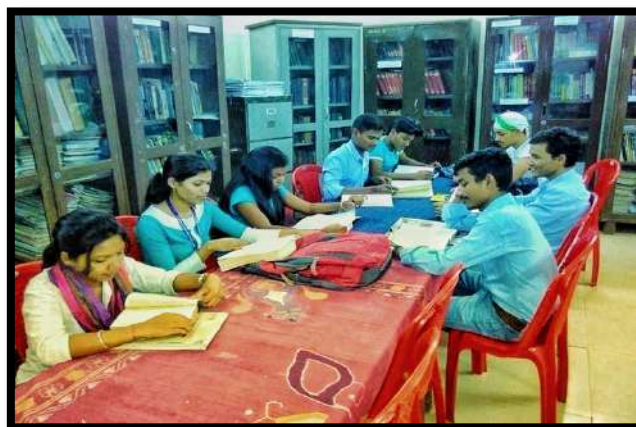
Students in the Department Library

The department has formed an academic body in the name of “Eastern Geographical Society” in the year 1971 under the Society Registration Act. This society has been playing an important role in spreading geographical knowledge in the state and country through annual meetings, conferences and publishing research articles in its Research Bulletins in the past. It’s Research Bulletin has now evolved to a national level Geographical Journal named “Eastern Geographer”.