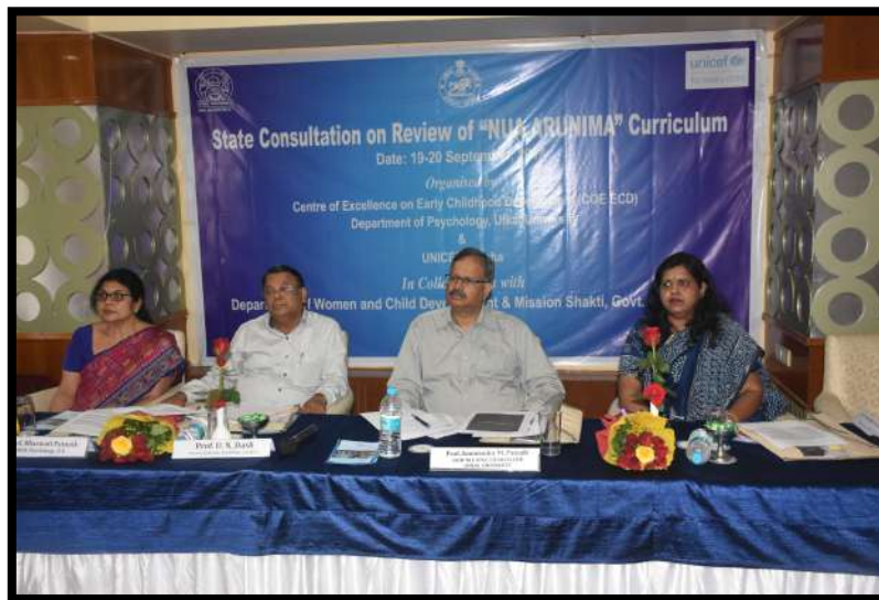
Workshop on revision of curriculum