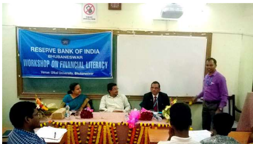
Workshop on Financial Literacy in Partnership with the RBI in February 2018