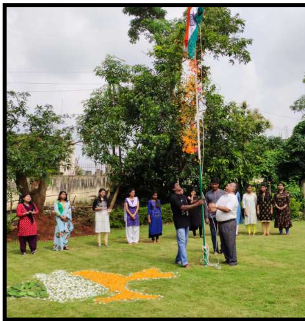
Independence day Celebration in the Dept.