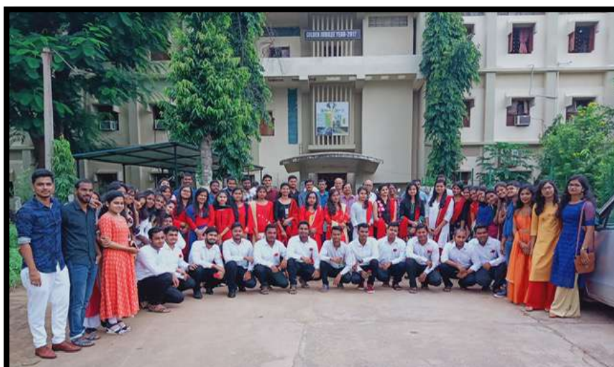
Fresher's welcome programme

Apart from sponsored projects from various funding agencies, the Department of Chemistry has been well recognized at