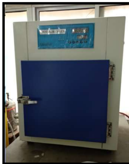
Hot air oven