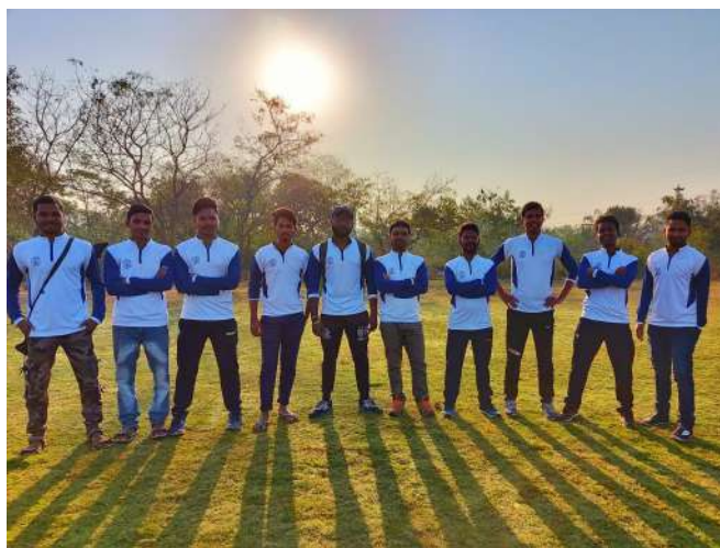
Students from the Department participated in Cricket Tournament organized in the University.

The Department of Public Administration has a well-stocked Library with more than 1000 books, journals and other publications. The library has two separate sections for storage of books as well as a reading room for the students. The Department also houses a separate seminar library for Journalism Students with more over a thousand books and other reading materials. The Students have access to a Computer lab with internet facility during the day and they can walk in anytime between 8 a.m. to 5 p.m. The Department has a unique platform the Wall Magazine for dissemination of information where students get the working experience of editing the content as well as deal with news and information.