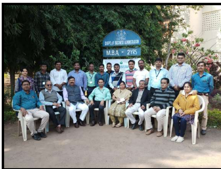
Faculty Members of the Dept