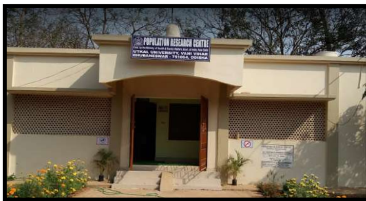
Population Research Centre building at campus

A network of Demographic Research Centres was established by Ministry of Health and Family Welfare, Government of India, which were later re-named as Population Research Centres (PRCs). Presently there are 18 PRCs, of which 12 are located in Universities while 6 are housed in Institutes of repute. All the 18 PRCs