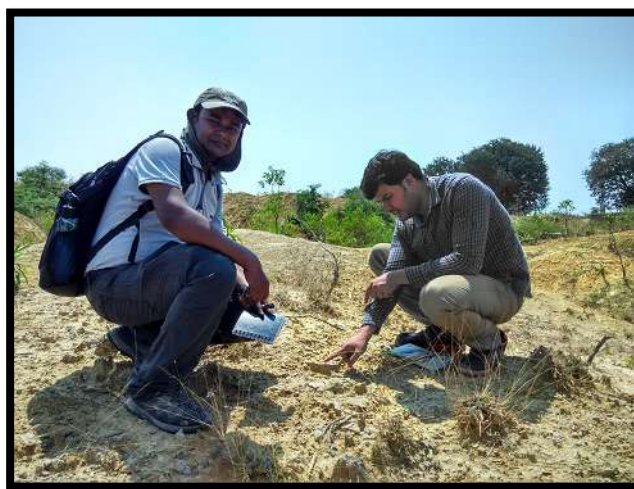
Students during field work

The fourth Semester students have successfully finished an exhaustive geological field investigation at various mines of Rajasthan. The 2nd semester students have carried out their field work around Dhauligiri, Mamubhanaja, Naraj, Talabasta area. M.Phil students have successfully completed one month training programme on remote sensing and GIS at Geological Survey of India (GSI), Hyderabad.