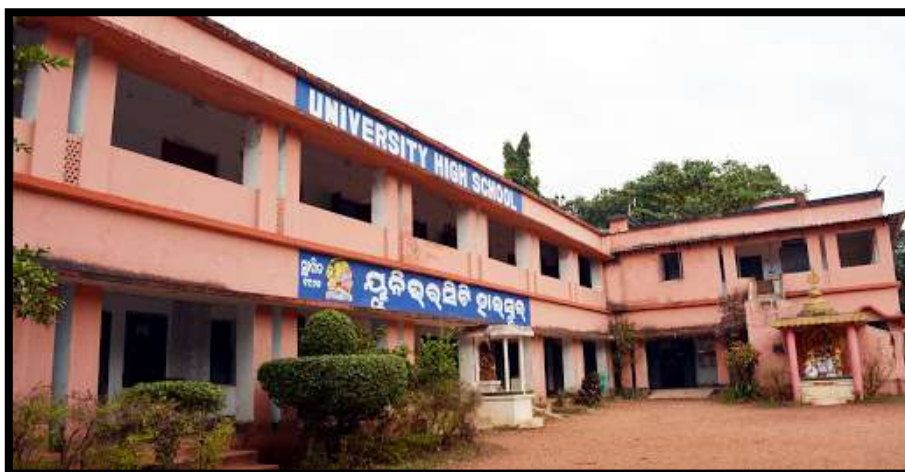
University High School infrastructure building