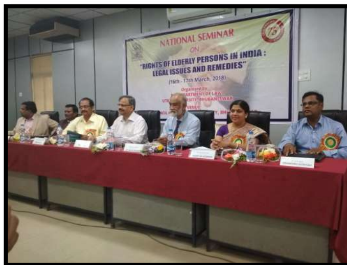
National Seminar on Rights of Elderly persons in India