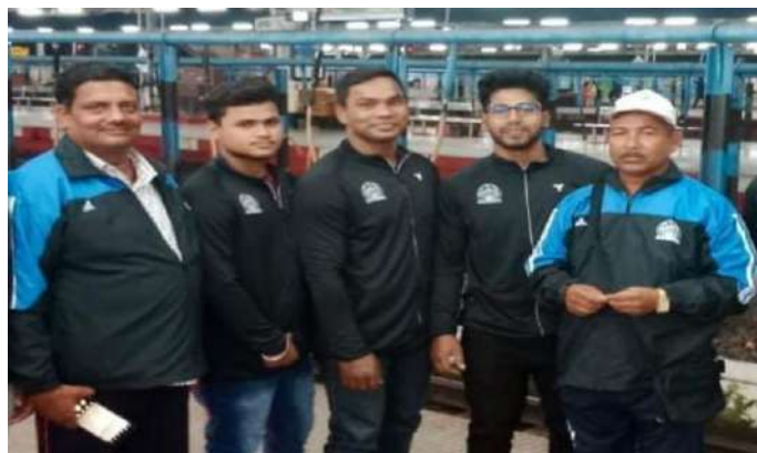
University WL & BP Team (All India)