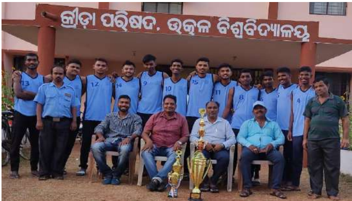
East Zone Champion University Basket Ball Team