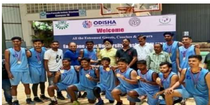
EAST ZONE INTER UNIVERSITY BASKET BALL (MEN) CHAMPION – 2021-22