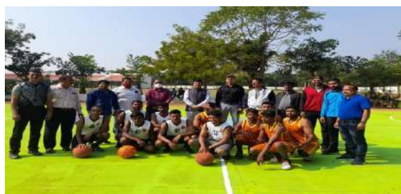
Inter College Basket Ball (M) Tournament