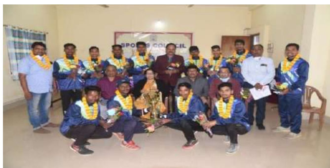
EAST ZONE INTER UNIVERSITY KHO-KHO(MEN) CHAMPION – 2021-22