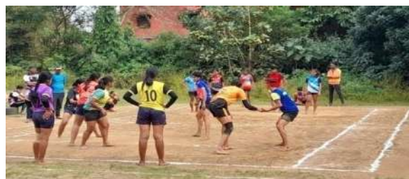
Inter College Kabaddi (W) Selection Trial