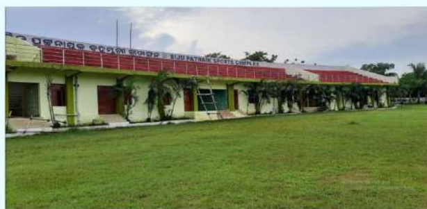
BIJU PATNAIK STADIUM