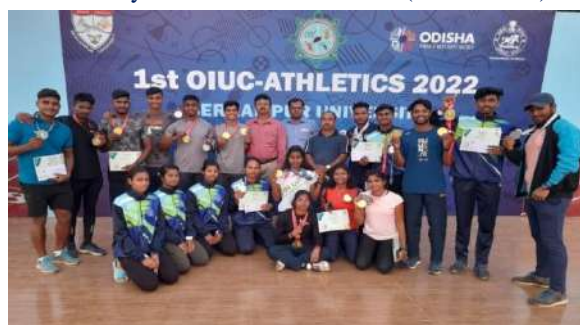
University Athletic Team (State Inter University Championship)