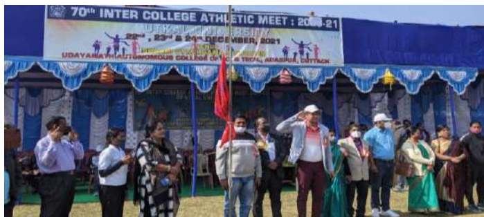
Opening ceremony of 70 th Inter College Athletic Team 2021-22