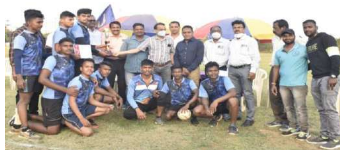
Inter College Hand Ball Champion Team 2021-22