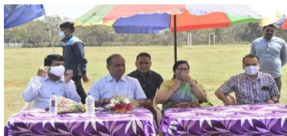
Guests are on the Dias Inter College Hand Ball (M) Tournament