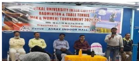
Inter College Badminton Tournament