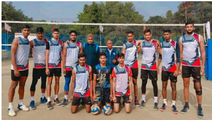
East Zone 3 rd position, University Volley Ball Team