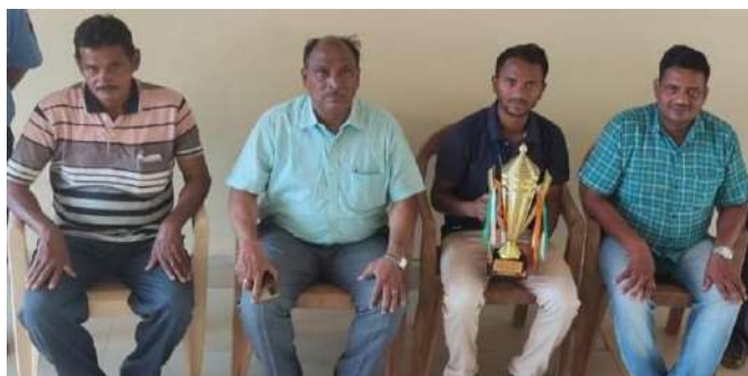
Individual Chess Champion (State University) 2021-22