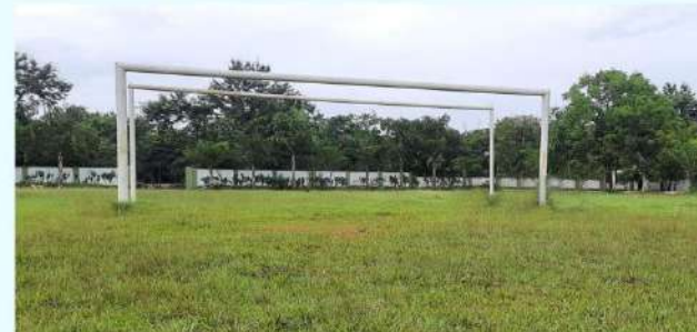
FOOT BALL COURT