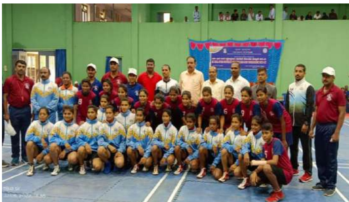
University Kho-Kho (W) Team (All India)