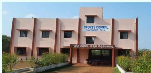
SPORTS COUNCIL BUILDING