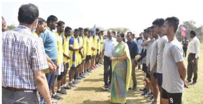
Inauguration of annual sports activities (2021-22)