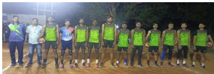
University Champion Volley Ball Team (State University)