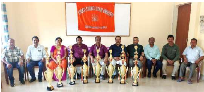
The Officials of Utkal University with State Championship Prizes