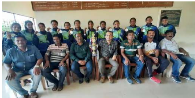
EAST ZONE INTER UNIVERSITY KHO-KHO (W) RUNNERS UP-2021-22