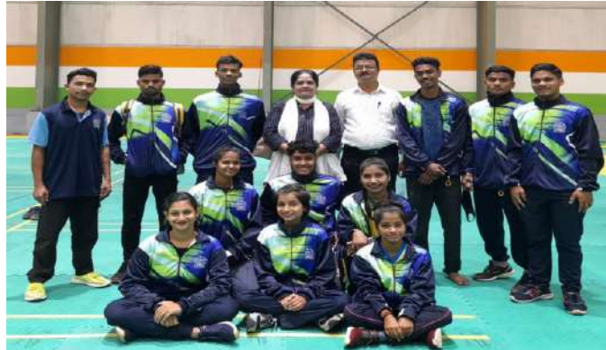
University Yoga (M/W) Team (All India)