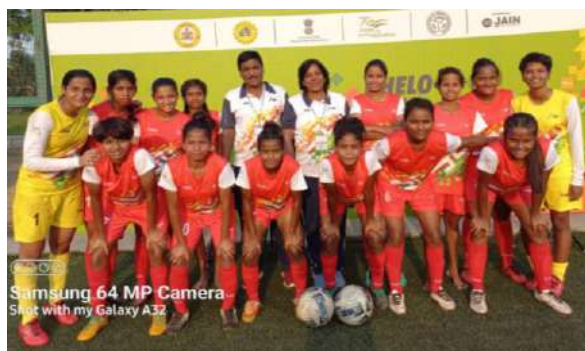
University Women Football Team (Khelo India)