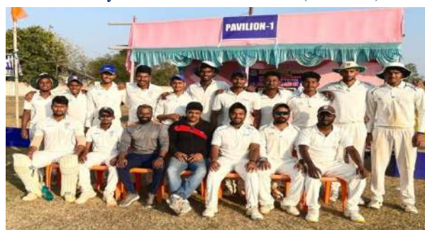
University Cricket Team (State Inter University Championship)