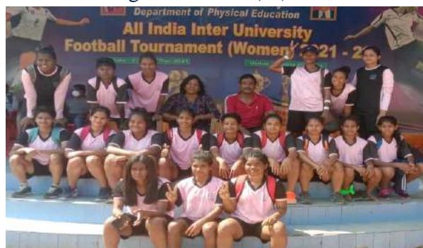
University Women Football Team (All India)