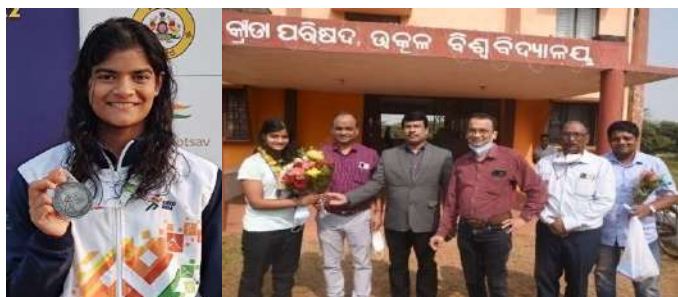
Silver & Bronze Medalist in All India/Khelo India Swimming Championship