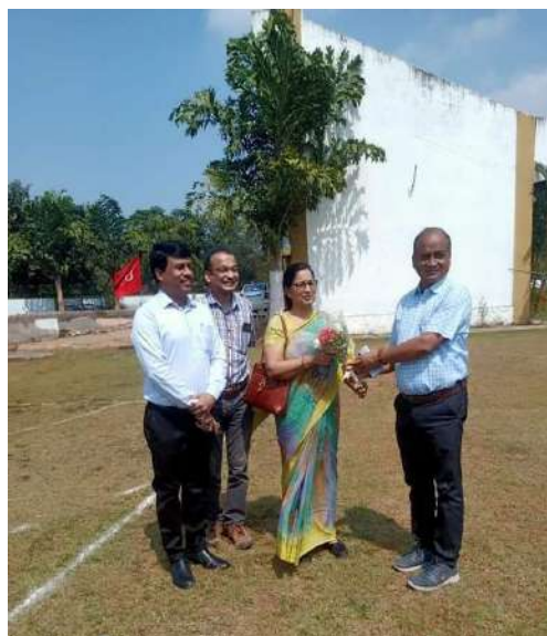
Inauguration of Hand Ball Court at Biju Patnaik Sports Complex