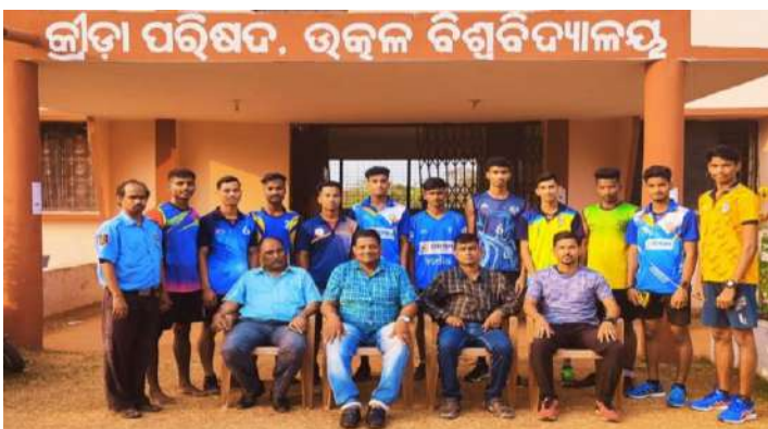
University Kho-Kho (M) Team (All India)