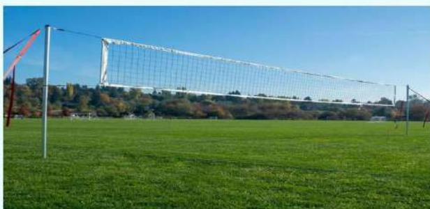
VOLLEY BALL COURT