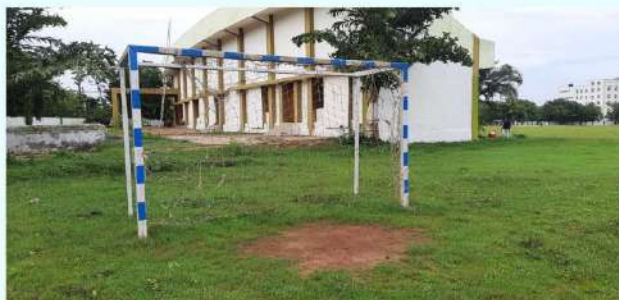
HAND BALL COURT